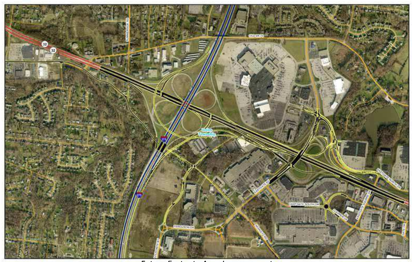
Future Eastgate Area Improvements

State Route 32 serves as Clermont County's most vital transportation artery, bisecting the county from west to east. State Route 32 will be transformed within the next five years with over $80 million in improvements planned. The interchange with Interstate 275 will be reconstructed to improve the flow of traffic. Parallel access roads will provide local access and allow State Route 32 to better function as a limited access freeway. These changes will improve safety and decrease travel times, particularly to industrial areas in the eastern part of the county. These improvements are discussed further in the transportation chapter.