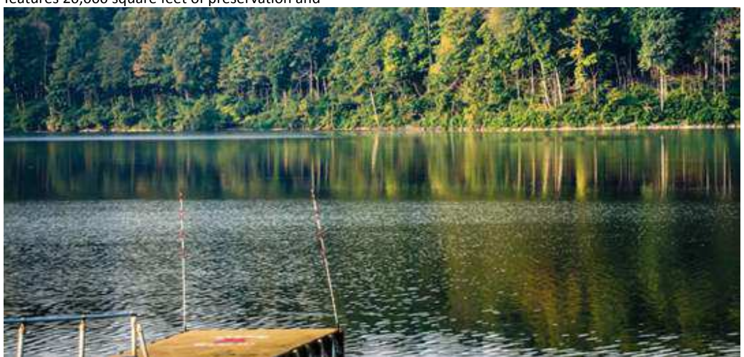
More Information: http://www.clermontcountyohio.biz/

Underground Railroad Freedom Trail – the Clermont County Ohio Freedom Trail is a self-guided tour that highlights thirty-three Underground Railroad and Abolitionist sites throughout the county's scenic rolling hills and along the Ohio River. The Freedom Trail features nineteen sites included in the Network to Freedom program of the National Park Service.