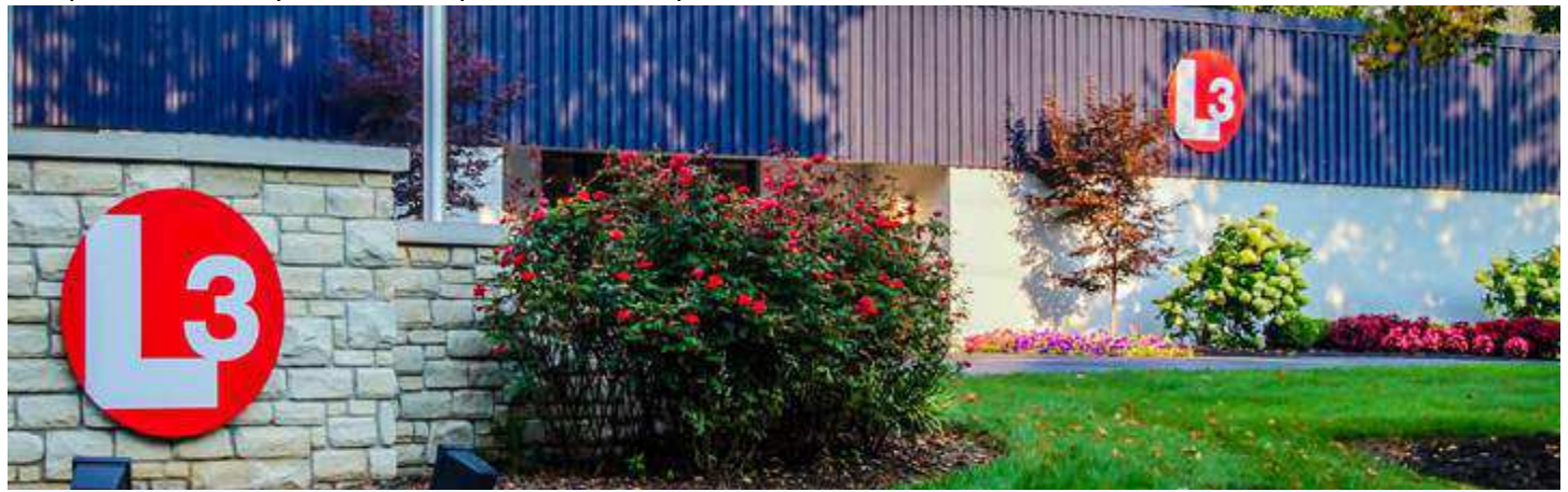
More Information: http://www.clermontcountyohio.biz/

Economic development activities are managed by the Department of Community and Economic Development (CED). One of the primary functions of this department is to work with companies seeking to make a new investment in Clermont County to purchase or lease an existing facility or construct a new one. CED helps companies identify and obtain the assistance they need to grow. Having the economic development and planning staff in the same department provides the opportunity for close working relationships to help guide the future development of the county.